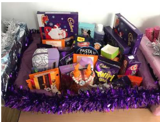
Purple & Orange Hamper

Some examples of Hampers from previous years to give you some ideas for donations: