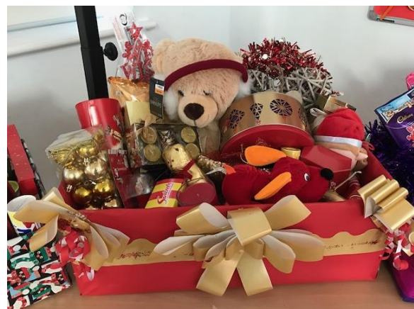
Red & Gold Hamper